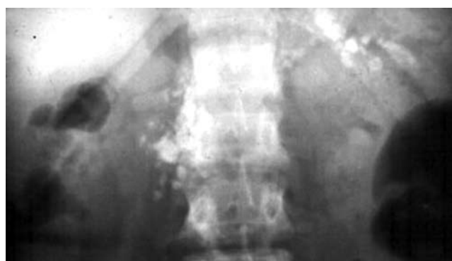
Fig. 2 : Plain radiograph of abdomen showing calcific opacities in the pancreas in a case of primary hyperparathyroidism with chronic calcific pancreatitis.

with normocalcemia, primary hyperparathyroidism was suspected on the basis of clinical and radiological features. Serum calcium increased to levels above upper limit of normal in 10 of these cases with vitamin D replacement over two weeks. In 5 out of these 10 cases, serum 25-hydroxy vitamin D levels were done and found to be low in all of them.